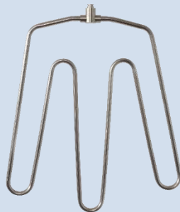
PX21070-J for heavy work jackets