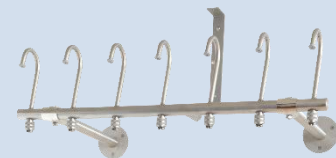
PX2117-HW headwear dryer, on top of air tube (optional)