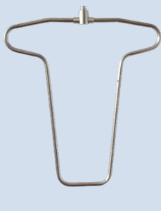
PX21065-JL for light work jackets

Design your own COMBO drying system with our body-shaped designed hangers: