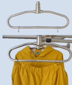
PX21020-JS for oilskins or V-neck jackets, splash suits (with trouser hooks)